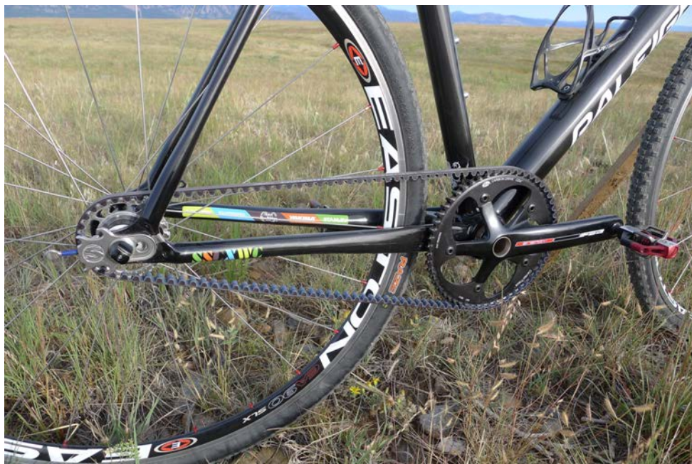
CenterTrack drive on team bikes

Info: Mitch represented at SSCXWC 2010, taking a 3 rd to put Gates on the podium. Previous highlights include winning the semi-pro class of the Mountain States Cup in 2004.